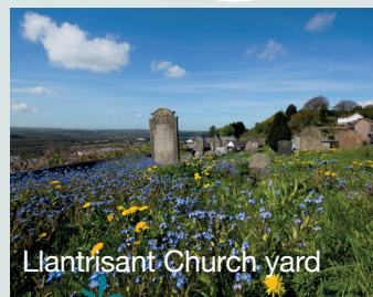
Llantrisant Church yard