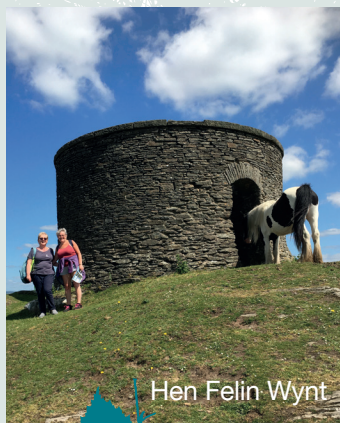
Hen Felin Wynt