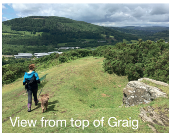
View from top of Graig